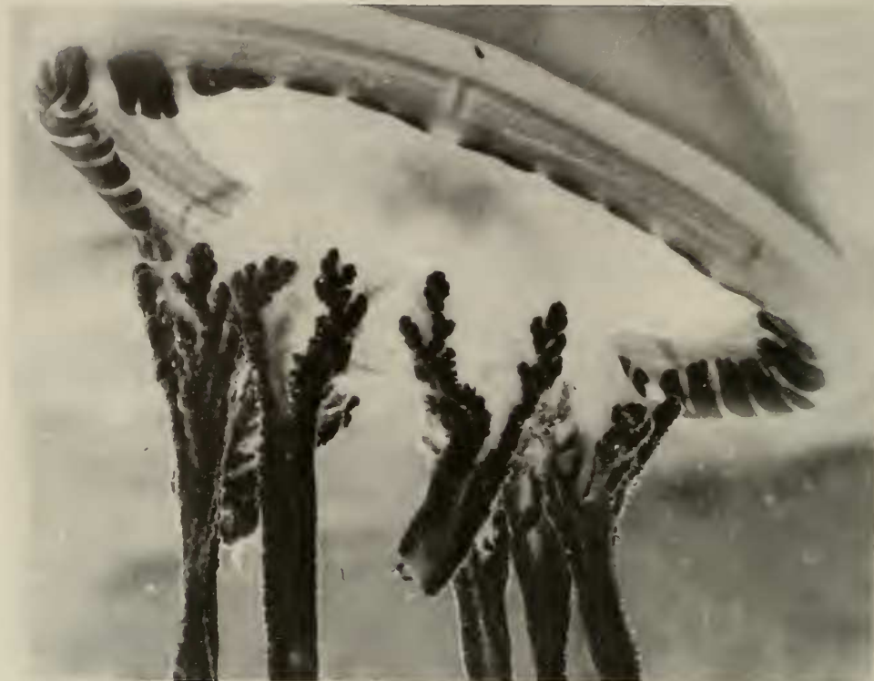
Fig. 2. Thysanostoma loriferum showing the bell margin and the proximal portions of the mouth-arms. Note the characteristic sparse fringing along the edges of the mouth-arms.

distinguishes the Thysanostomatidae from all other rhizostomes. The endings -ferum and -latum agree (after Kramp 1961) in neuter gender with the generic name.